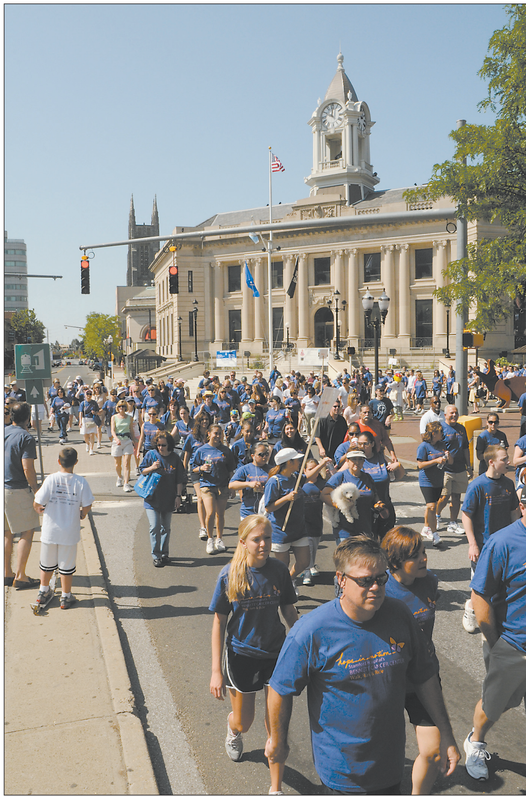
More than 4,000 participants stride Sunday up Atlantic Street near the turnoff for Main Street in Stamford during the Hope in Motion Walk, Run & Ride event benefiting the Bennett Cancer Center. In the background is the Old Town Hall.

The Stamford Hospital Foundation spent only a few hundred dollars to host the event because